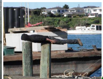
Planking on the job!!!