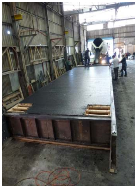
The special black pontoon being cast in Total Floating Systems factory in Halsey Street

It's a good job the boys did the business in the final over the French.