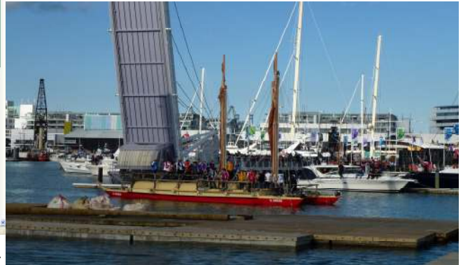
The sailing Waka passes under the opened Te Wero Bridge in the Viaduct Harbour during the Rugby World Cup opening ceremony

Total Marine Services recently reconfigured the Eastern Viaduct to accommodate the twenty Wakas used to celebrate the opening of the Rugby World Cup. Less than 12 hours later the Eastern Viaduct was reconfigured again for the Auckland International Boat Show.