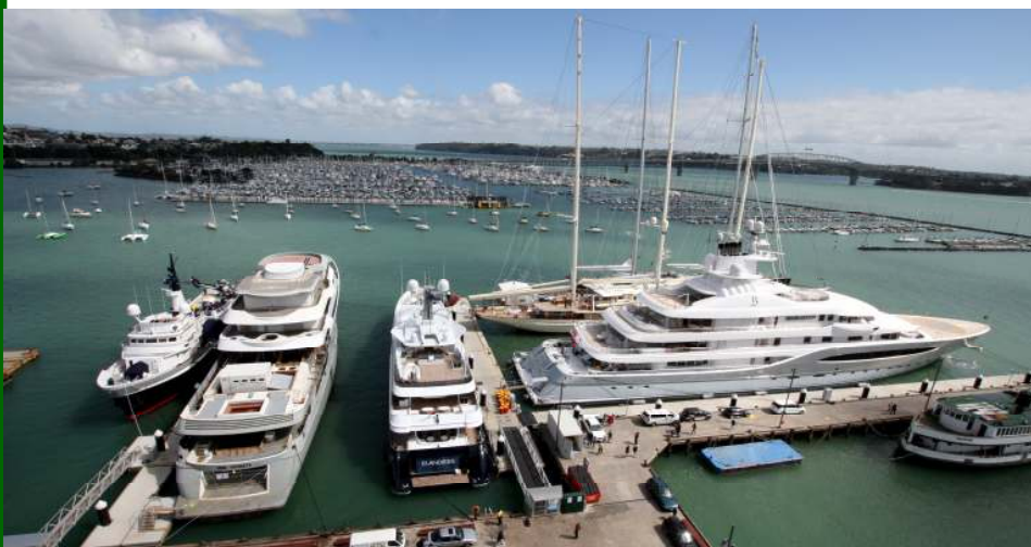
Silo Park in Wynyard Quarter has become the new home of Super Yachts in Auckland. A total of 6 berths are available that range from 50m to 95m in length.

This years show coincided with the Rugby World Cup and a number of international rugby supporters were seen and heard amongst the local visitors.