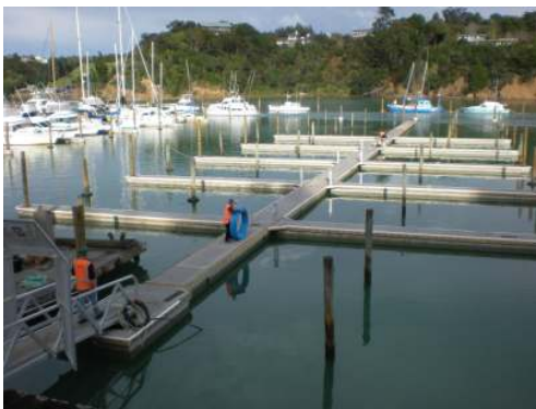
The almost finished D Pier

The original piers were installed in 1982 and are showing signs of fatigue and failure.