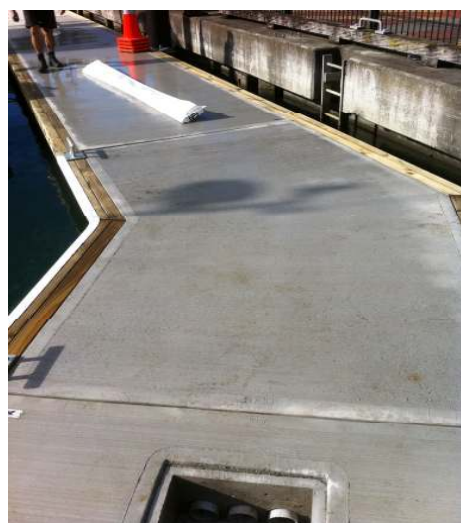
The iconic 1000th pontoon manufactured by Total Floating Systems. The pontoon was custom made to follow the adjoining wall in the Viaduct Harbour, Auckland